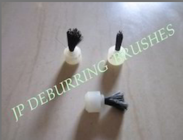
CNC Turret Punch Table Brush