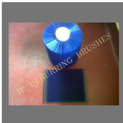
Gherkin Washing Brushes