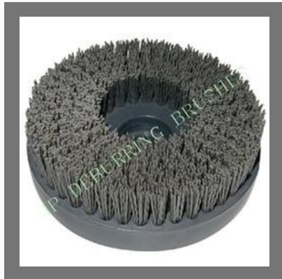
Planetary Head Deburring Brushes