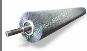
Peaching Machine Roller Brush