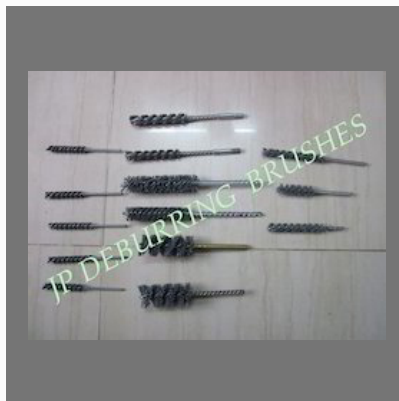
Abrasive Filament ID Brushes