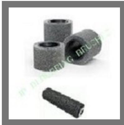
Wide Face Brushes