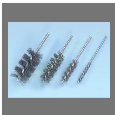
Twisted Wire Brushes/ID Deburring Brush