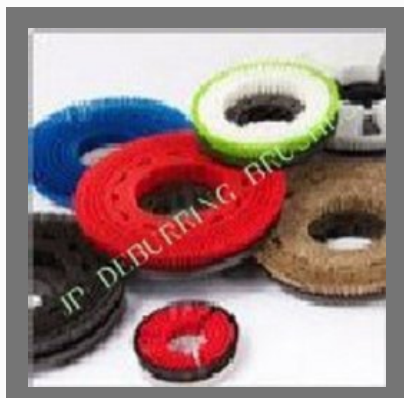
Floor Cleaning Disc Brushes