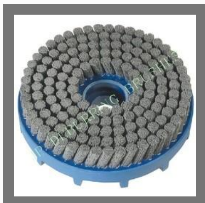
Dot Heavy Disc Brushes