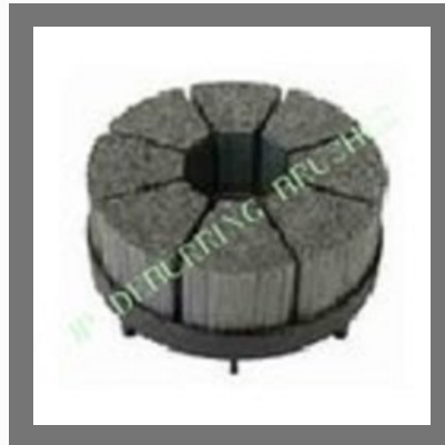
Heavy Deburring Disc Brushes