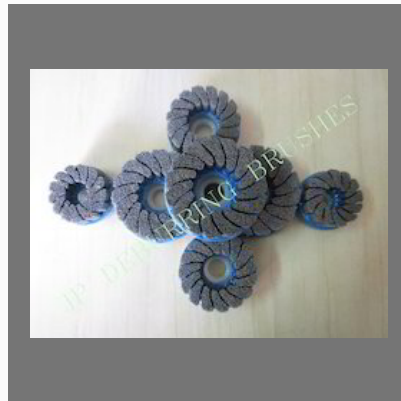
Turbine Disc Brushes