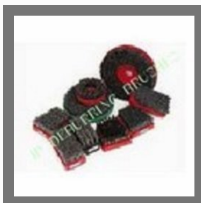
Stone Polishing Brushes