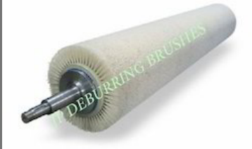
Sueding Roller Brush (Ceramic Bristles)