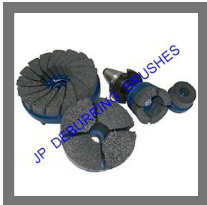
VMC HMC Disc Brushes