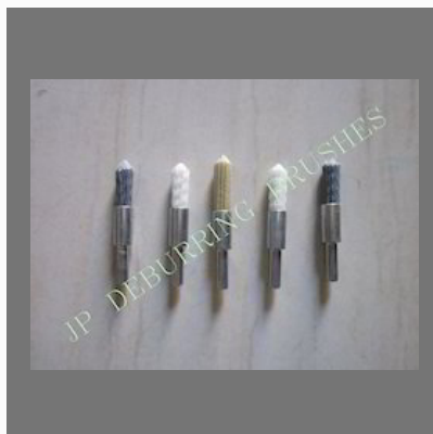
Deburring End Brushes